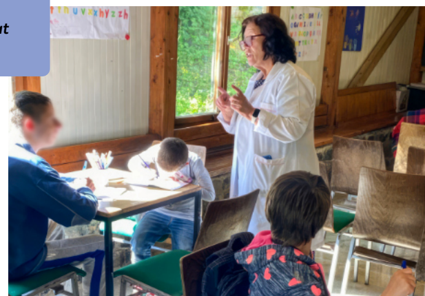
Homework help and recreational activities at the children's center